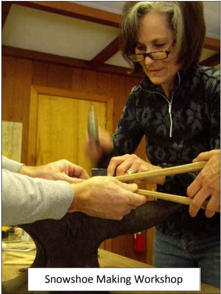
Snowshoe Making Workshop

If you haven't visited lately, here are some photos of our new renovations and activity opportunities.