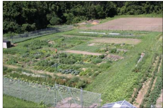
Current aerial view of active farm in foreground and tilled expansion area for 2012 in background.

We are currently exploring grants and other funding opportunities to continue to grow the farm. We need to add more 10' tall fencing to enclose the full two acres we'll be farming next year. We want to add more greenhouses and hoop-houses to our facilities, and of course we need equipment to make our farm more efficient. An electric 2x4 Gator for hauling the harvest is at the top of the list. If you know anyone with a Gator or other used farm equipment they are willing to donate for a tax-deduction, have them contact us.