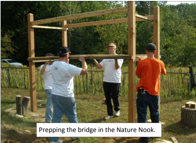
Prepping the bridge in the Nature Nook.