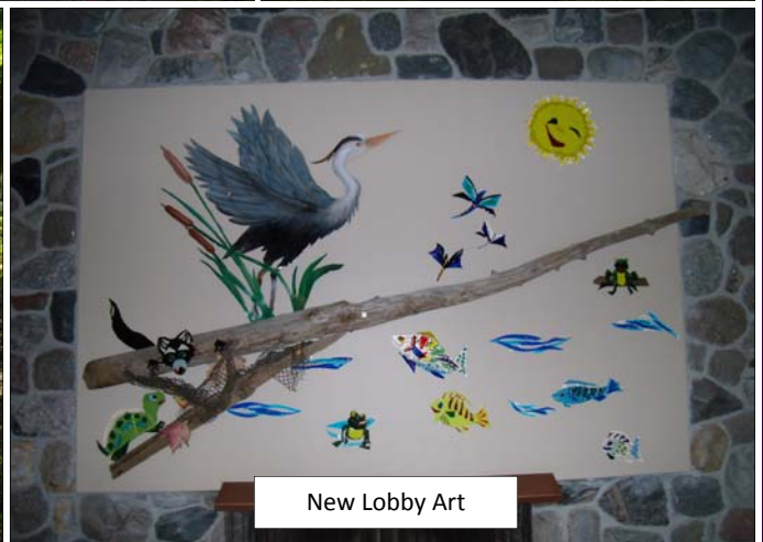
New Lobby Art