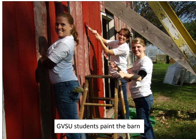
GVSU students paint the barn