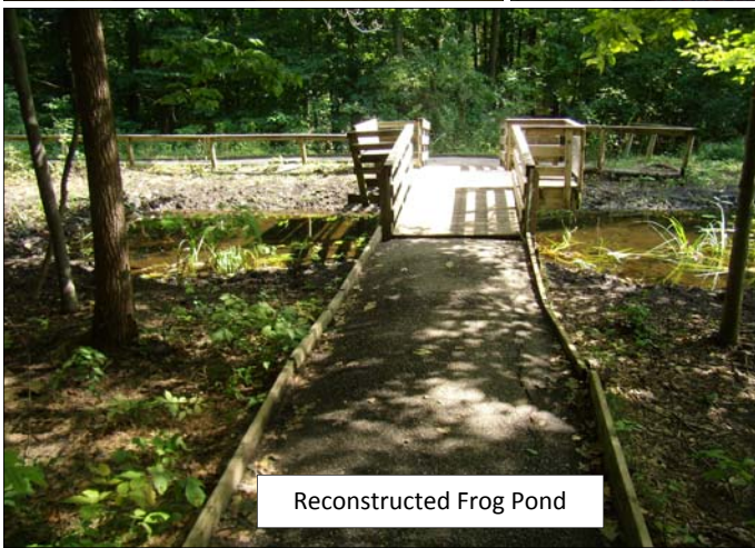
Reconstructed Frog Pond