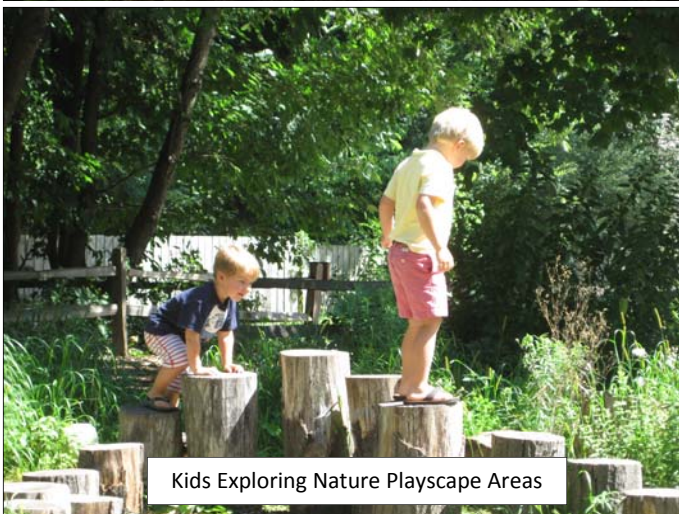
Kids Exploring Nature Playscape Areas