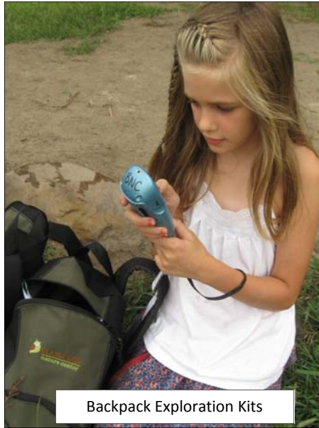
Backpack Exploration Kits