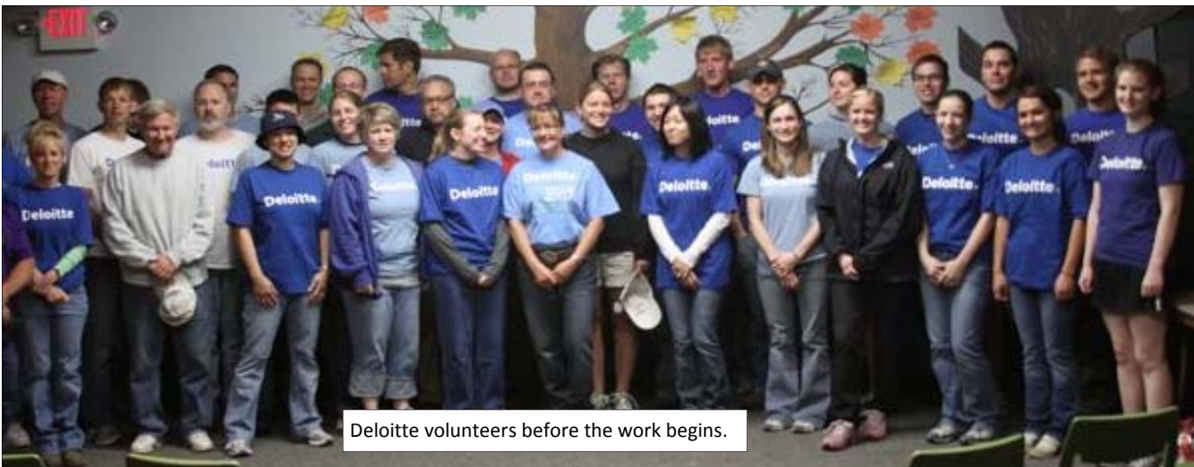
Deloitte volunteers before the work begins.