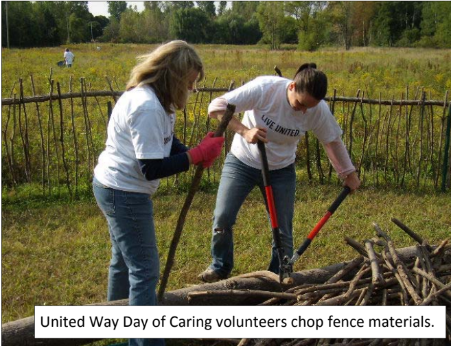
United Way Day of Caring volunteers chop fence materials.